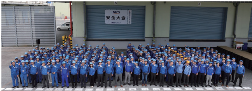
Photo: Participants of the Safety Convention

We will continue to work together as One NRS to prioritize accident prevention and achieve our safety goals.