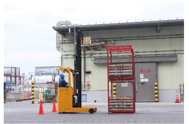
Demonstration: Basic Operations for Cargo Stored at Elevated Places