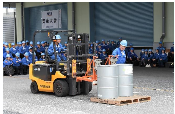
Demonstration: Hidden Dangers of Auto Grippers