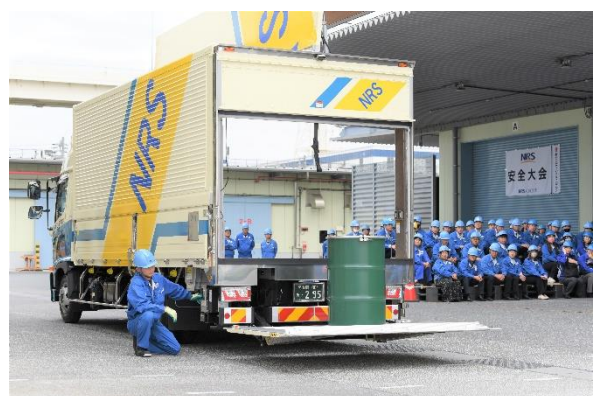
Demonstration: Regal Revisions Related to Truck